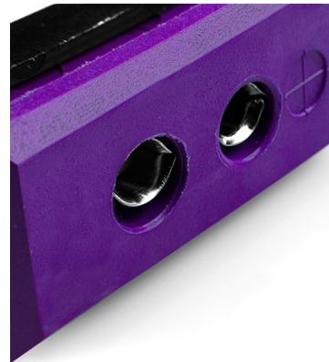
Standard Fascia Socket (with nylon mounting clip) (dimensions in mm)

Labfacility are the UK's leading manufacturer of Temperature Sensors, Thermocouple Connectors and associated Temperature Instrumentation and stockings of Thermocouple Cables. The Company has been trading since 1971 and is ISO9001 accredited.