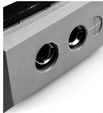
Standard Fascia Socket (with nylon mounting clip) (dimensions in mm)

Labfacility are the UK's leading manufacturer of Temperature Sensors, Thermocouple Connectors and associated Temperature Instrumentation and stockings of Thermocouple Cables. The Company has been trading since 1971 and is ISO9001 accredited.