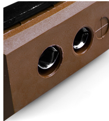
Standard Fascia Socket (with nylon mounting clip) (dimensions in mm)

Labfacility are the UK's leading manufacturer of Temperature Sensors, Thermocouple Connectors and associated Temperature Instrumentation and stockings of Thermocouple Cables. The Company has been trading since 1971 and is ISO9001 accredited.