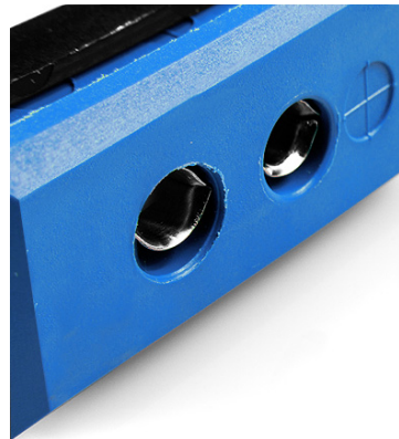
Standard Fascia Socket (with nylon mounting clip) (dimensions in mm)

Labfacility are the UK's leading manufacturer of Temperature Sensors, Thermocouple Connectors and associated Temperature Instrumentation and stockings of Thermocouple Cables. The Company has been trading since 1971 and is ISO9001 accredited.