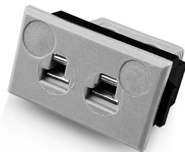
Miniature Fascia Socket (with nylon mounting clip) (dimensions in mm)

Labfacility are the UK's leading manufacturer of Temperature Sensors, Thermocouple Connectors and associated Temperature Instrumentation and stockings of Thermocouple Cables. The Company has been trading since 1971 and is ISO9001 accredited.