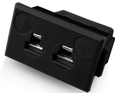
Miniature Fascia Socket (with nylon mounting clip) (dimensions in mm)

Labfacility are the UK's leading manufacturer of Temperature Sensors, Thermocouple Connectors and associated Temperature Instrumentation and stockings of Thermocouple Cables. The Company has been trading since 1971 and is ISO9001 accredited.