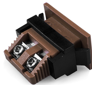
Miniature Fascia Socket (with nylon mounting clip) (dimensions in mm)

Labfacility are the UK's leading manufacturer of Temperature Sensors, Thermocouple Connectors and associated Temperature Instrumentation and stockings of Thermocouple Cables. The Company has been trading since 1971 and is ISO9001 accredited.