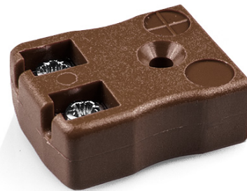
Miniature in-line Socket - Quick Wire (dimensions in mm)

Labfacility are the UK's leading manufacturer of Temperature Sensors, Thermocouple Connectors and associated Temperature Instrumentation and stockings of Thermocouple Cables. The Company has been trading since 1971 and is ISO9001 accredited.