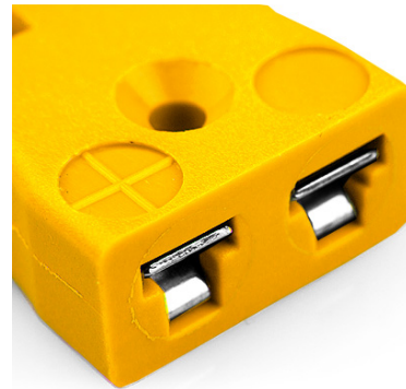
Miniature in-line Socket - Quick Wire (dimensions in mm)

Labfacility are the UK's leading manufacturer of Temperature Sensors, Thermocouple Connectors and associated Temperature Instrumentation and stockings of Thermocouple Cables. The Company has been trading since 1971 and is ISO9001 accredited.