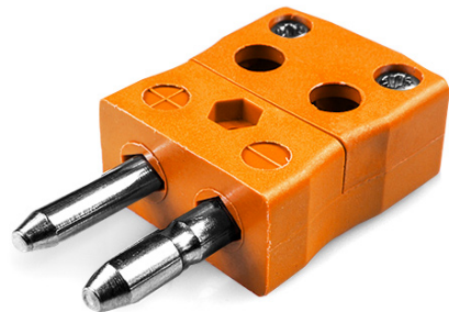
Standard in-line Plug - Quick Wire (dimensions in mm)

Labfacility are the UK's leading manufacturer of Temperature Sensors, Thermocouple Connectors and associated Temperature Instrumentation and stockings of Thermocouple Cables. The Company has been trading since 1971 and is ISO9001 accredited.