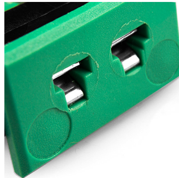
Miniature Fascia Socket (with nylon mounting clip) (dimensions in mm)

Labfacility are the UK's leading manufacturer of Temperature Sensors, Thermocouple Connectors and associated Temperature Instrumentation and stockings of Thermocouple Cables. The Company has been trading since 1971 and is ISO9001 accredited.