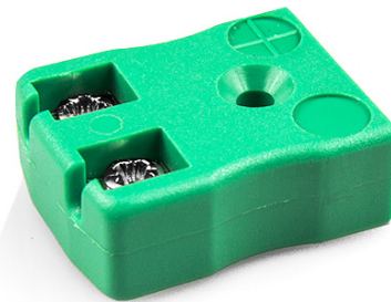
Miniature in-line Socket - Quick Wire (dimensions in mm)

Labfacility are the UK's leading manufacturer of Temperature Sensors, Thermocouple Connectors and associated Temperature Instrumentation and stockings of Thermocouple Cables. The Company has been trading since 1971 and is ISO9001 accredited.