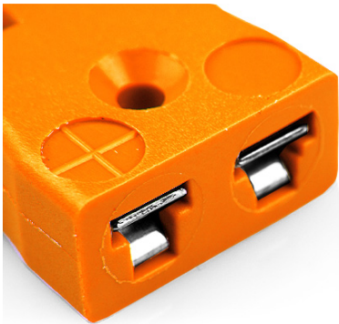
Miniature in-line Socket - Quick Wire (dimensions in mm)

Labfacility are the UK's leading manufacturer of Temperature Sensors, Thermocouple Connectors and associated Temperature Instrumentation and stockings of Thermocouple Cables. The Company has been trading since 1971 and is ISO9001 accredited.