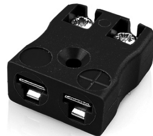
Miniature in-line Socket - Quick Wire (dimensions in mm)

Labfacility are the UK's leading manufacturer of Temperature Sensors, Thermocouple Connectors and associated Temperature Instrumentation and stockings of Thermocouple Cables. The Company has been trading since 1971 and is ISO9001 accredited.