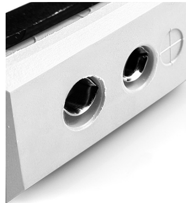
Standard Fascia Socket (with nylon mounting clip) (dimensions in mm)

Labfacility are the UK's leading manufacturer of Temperature Sensors, Thermocouple Connectors and associated Temperature Instrumentation and stockings of Thermocouple Cables. The Company has been trading since 1971 and is ISO9001 accredited.