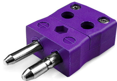
Standard in-line Plug - Quick Wire (dimensions in mm)

Labfacility are the UK's leading manufacturer of Temperature Sensors, Thermocouple Connectors and associated Temperature Instrumentation and stockings of Thermocouple Cables. The Company has been trading since 1971 and is ISO9001 accredited.