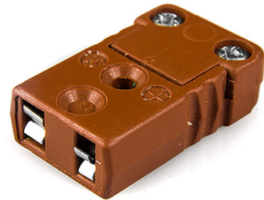
Miniature Hi-Temp Plastic in-line Socket - HTP (dimensions in mm)

Labfacility are the UK's leading manufacturer of Temperature Sensors, Thermocouple Connectors and associated Temperature Instrumentation and stockings of Thermocouple Cables. The Company has been trading since 1971 and is ISO9001 accredited.