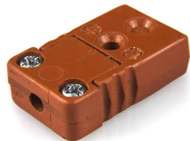
Miniature Hi-Temp Plastic in-line Socket - HTP