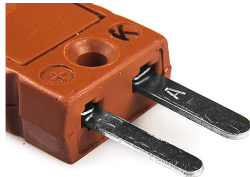
Miniature Hi-Temp Plastic in-line Plug - HTP (dimensions in mm)

Labfacility are the UK's leading manufacturer of Temperature Sensors, Thermocouple Connectors and associated Temperature Instrumentation and stockings of Thermocouple Cables. The Company has been trading since 1971 and is ISO9001 accredited.