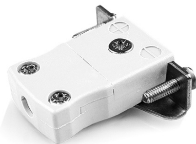
Miniature in-line Socket with stainless steel mounting bracket (dimensions in mm)

Labfacility are the UK's leading manufacturer of Temperature Sensors, Thermocouple Connectors and associated Temperature Instrumentation and stockings of Thermocouple Cables. The Company has been trading since 1971 and is ISO9001 accredited.