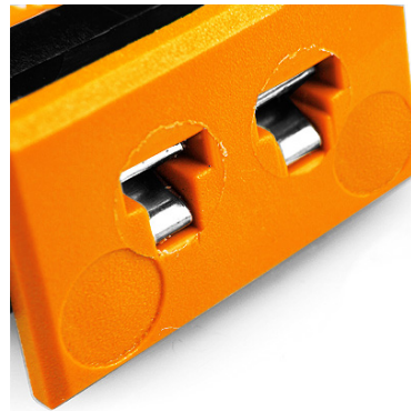
Miniature Fascia Socket (with nylon mounting clip) (dimensions in mm)

Labfacility are the UK's leading manufacturer of Temperature Sensors, Thermocouple Connectors and associated Temperature Instrumentation and stockings of Thermocouple Cables. The Company has been trading since 1971 and is ISO9001 accredited.