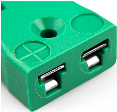
Miniature in-line Socket - Quick Wire (dimensions in mm)

Labfacility are the UK's leading manufacturer of Temperature Sensors, Thermocouple Connectors and associated Temperature Instrumentation and stockings of Thermocouple Cables. The Company has been trading since 1971 and is ISO9001 accredited.