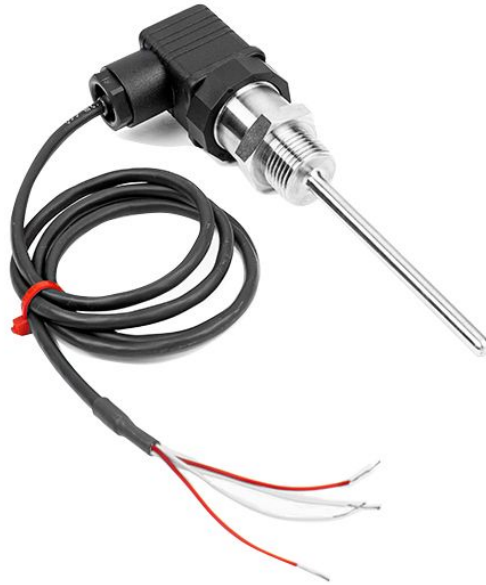
'HIRSCHMANN PT100 PROBE ASSEMBLY'